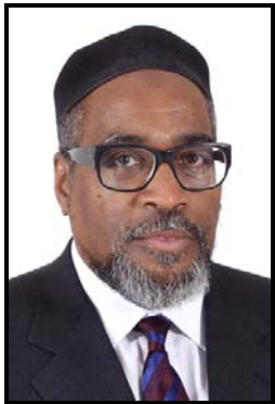
KENNETH GAMBLE Economic Empowerment